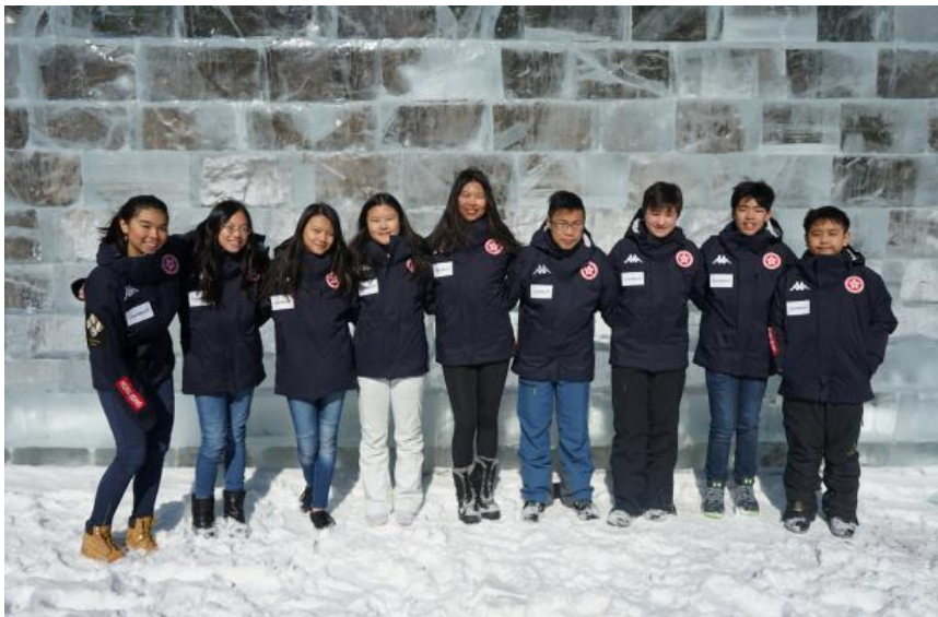
These nine young athletes meet for the first time to train for Olympics.